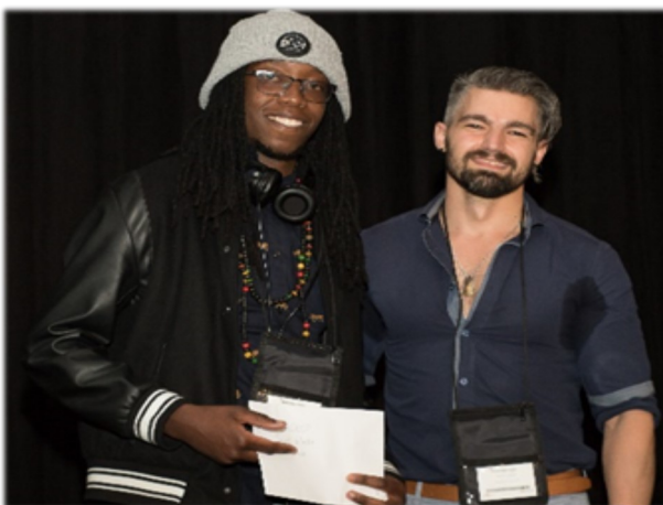
Social Media Award: