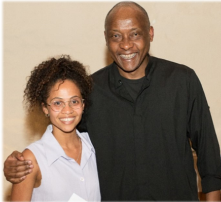
Best Oral Presentation Clinical Pharmacology Award: