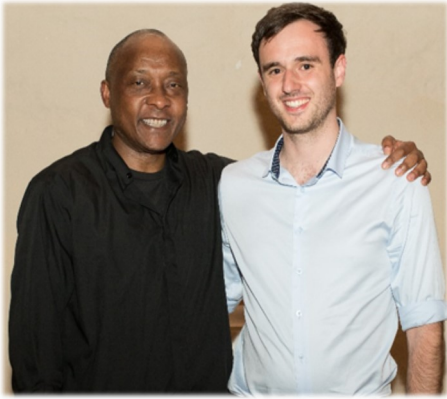
Best Oral Presentation Clinical Pharmacology Award: