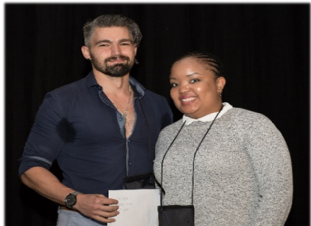
Social Media Award: